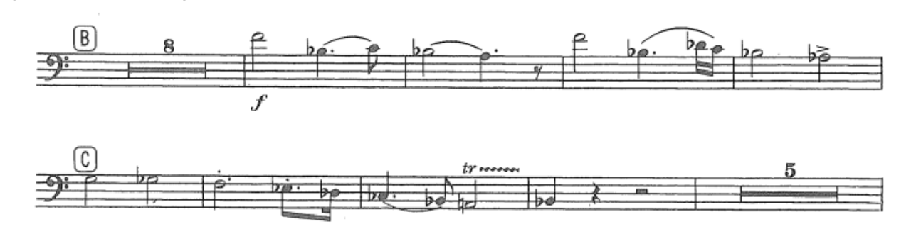
Henry Cowell, Shoonthree – A – B (include 1<sup>st</sup> bar of B)

Paul Hindemith, March from Symphonic Metamorphosis – 4 before C – 3<sup>rd</sup> after C (Baritone part) (2/2 time, half = 80)