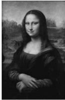
Fig. 1. Leonardo da Vinci, Mona Lisa , Musée du Louvre, Paris